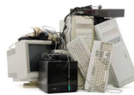
Computers, monitors, TVs & other electronic goods