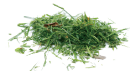
Green waste (nothing over 4 ft. long and 1 ft. in diameter)