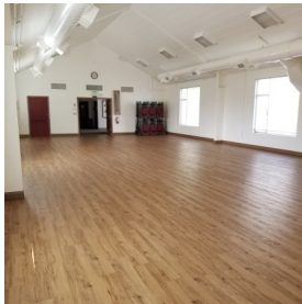
Main Hall (upstairs) Capacity 116 dining 249 assembly

There are three rental areas available in the building. Facility users can rent one room or the whole building depending upon the size and type of event.