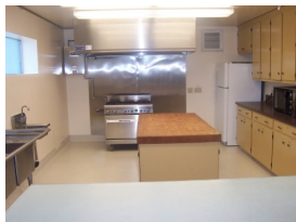
Commercial Kitchen (downstairs) Included with a room rental.