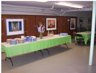
Dining Room (downstairs) Capacity 112 dining 240 assembly